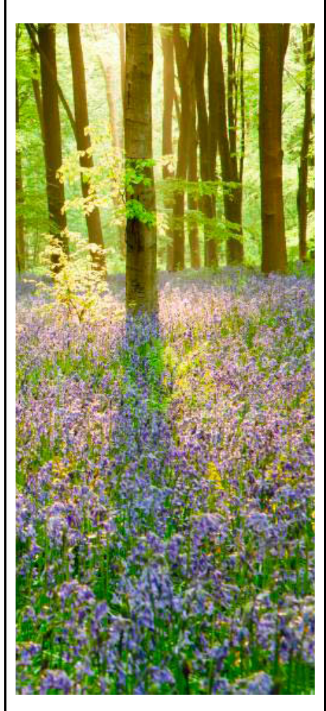
Excellence and expertise whatever the season